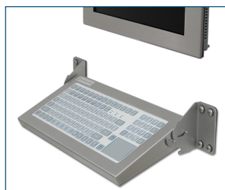
Panel Mount workstation configuration with monitor and industrial keyboard.