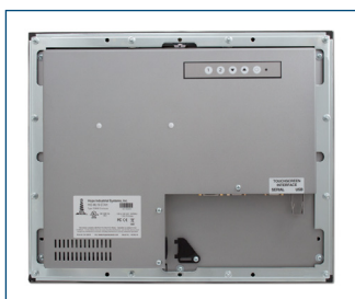
Rear view of 19" Panel Mount Monitor.