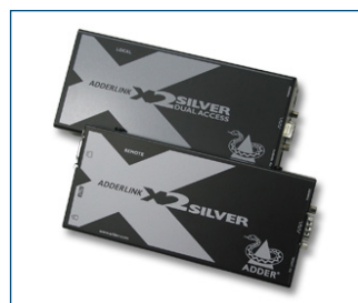
Optional KVM Extender allows monitor to be placed up to 300m away from computer.