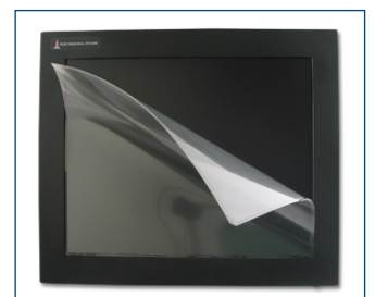
Optional Screen Protector guards touch screens from scratches and wear.